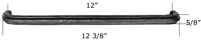
HP791-12 Monte Vista